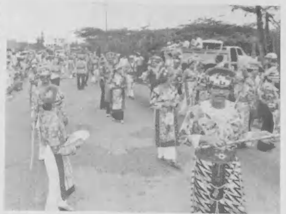
The Hmong of Laos (Eso Club)